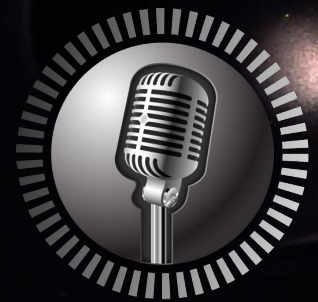
On board microphone

The K8094 allows you to record and play messages of up to 8 minutes long. Recording speed is continuously adjustable so that you can choose a perfect compromise between duration and sound quality. It also allows you to generate funny sound effects. Messages are retained in memory at power loss. The unit comes complete with microphone, line level in- and output and an output for a small speaker.