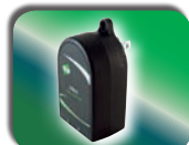
SE Range Extenders