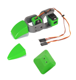
VR013: 3 servo leg