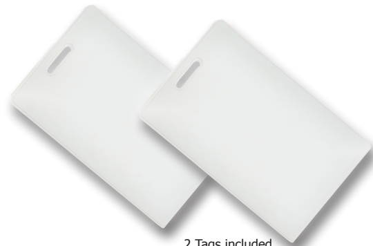
2 Tags included part # HAA2866/TAG