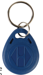
optional access badge part # HAA2866/TAG2